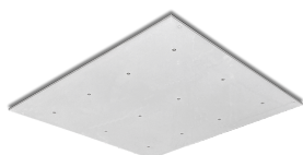
SQR 750x750-12 IP67